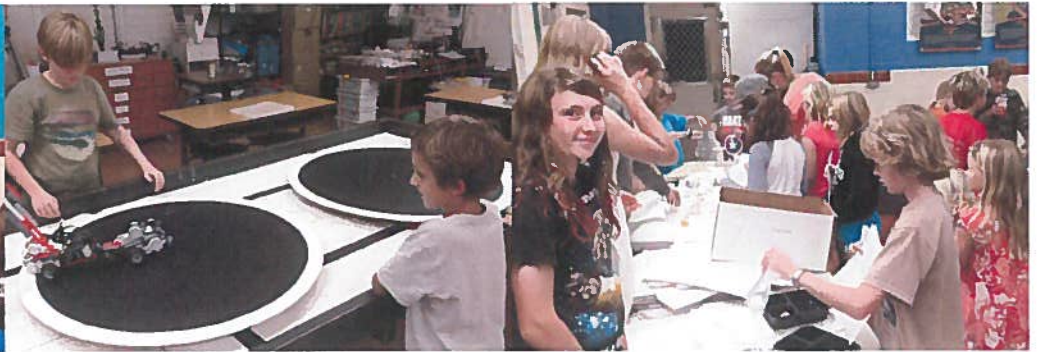
Sixth Grade students demonstrate leadership skills at STEM night.

Mahalo to Kokua Hawaii Foundation for Mini-Grant awarded to Lanikai School which brought Banana Slugs String Band, who shared their love of ecology, and sustainability. Please ask your child how "Dirt Made My Lunch."