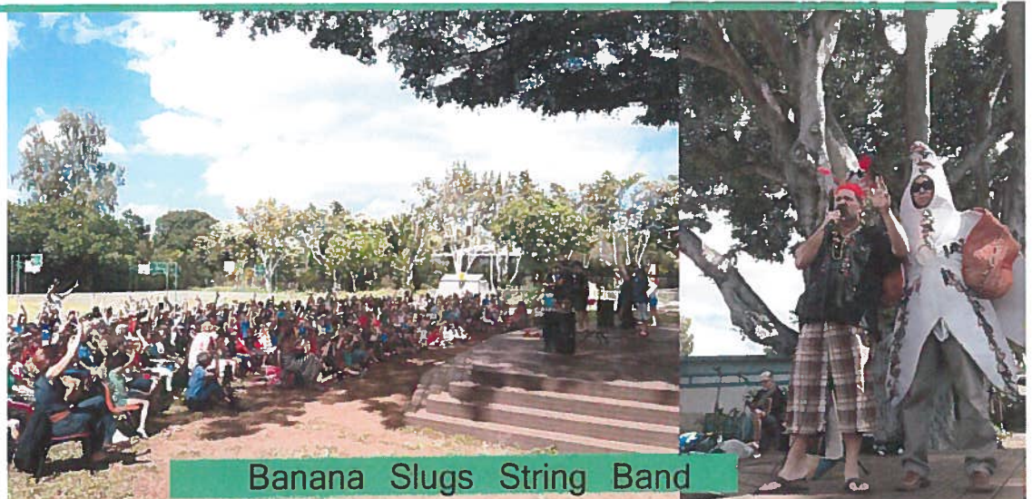
Banana Slugs String Band

Mahalo to Kokua Hawaii Foundation for Mini-Grant awarded to Lanikai School which brought Banana Slugs String Band, who shared their love of ecology, and sustainability. Please ask your child how "Dirt Made My Lunch."